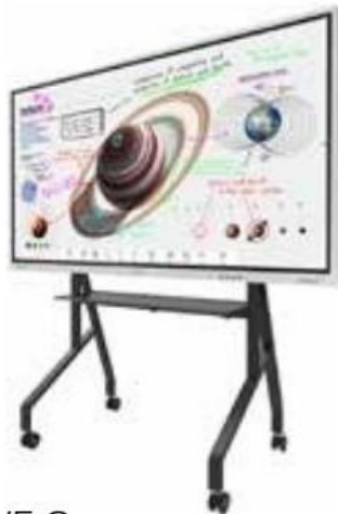
FL50-525BL1 MOVE Go