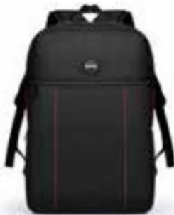
105330 Portland Laptop Backpack

With PORT Designs notebook docks, enhance your classroom or remote setup for a brighter, more interactive future. Experience the future of education technology today.