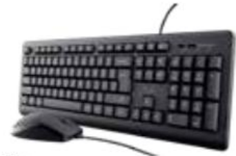
TKM-250 Wired Keyboard & Mouse

Engage learners with interactive gaming products designed for the eSports curriculum, from TRUST.