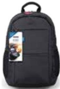
135074 Sydney Backpack