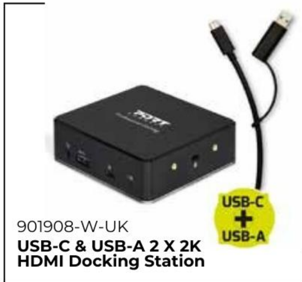
901908-W-UK USB-C & USB-A 2 X 2K HDMI Docking Station