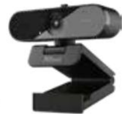
ECO TW-200 Webcam