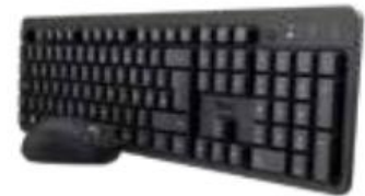
TKM-360 Silent Wireless Keyboard & Mouse set