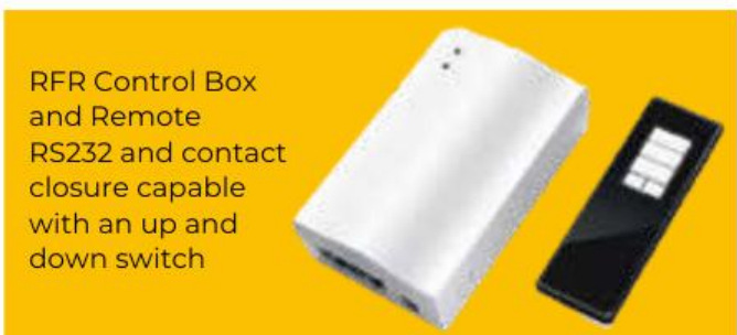
RFR Control Box and Remote RS232 and contact closure capable with an up and down switch