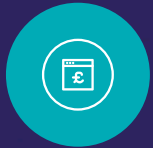
Banking & Finance